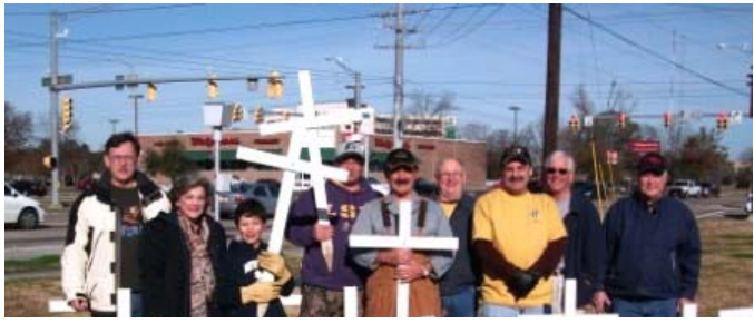
Our volunteers who set up the Cemetery of the Innocents