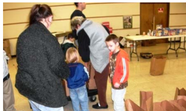
Participants in our YAP Program helping to sort food for the Christmas Food Drive

SANTA WAS A HIT WITH ALL OF THE KIDS ATTENDING OUR CHRISTMAS PARTY. EVERYONE BRAVED THE NASTY WEATHER TO SPEND SOME TIME WITH SAINT NICK AND SING HAPPY BIRTHDAY TO JESUS!!