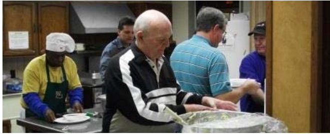
Our "Heaven's Kitchen" Staff