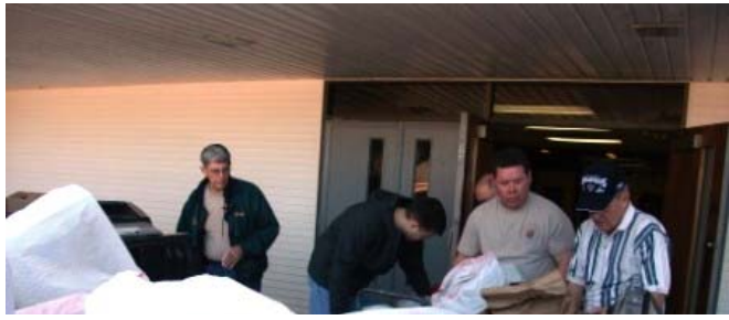
93 FOOD BASKETS WERE DISTRIBUTED TO THE NEEDY THIS CHRISTMAS BY OUR COUNCIL